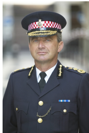
Mike Bowron QPM Commissioner City of London Police