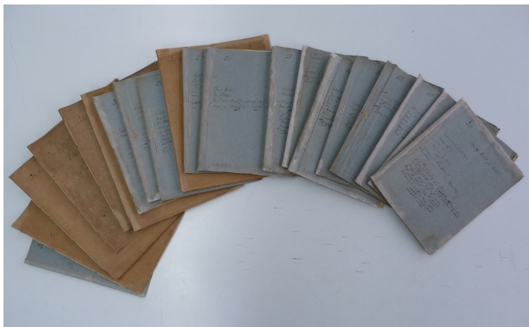
Overview of the pamphlets repaired so far.