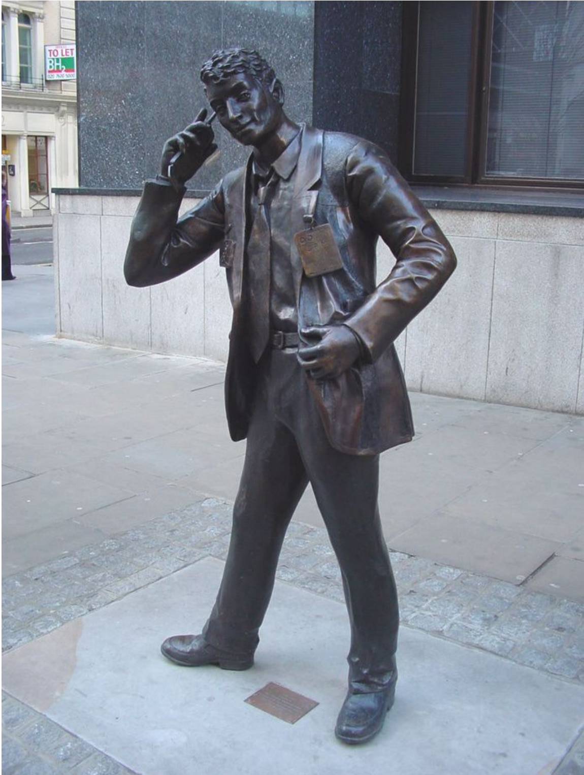
Photograph of the LIFFE Trader statue in its original location in Walbrook