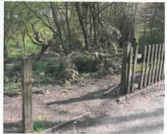
Buildings in parks are at risk of being sold, and parks decline where there is a lack of investment.