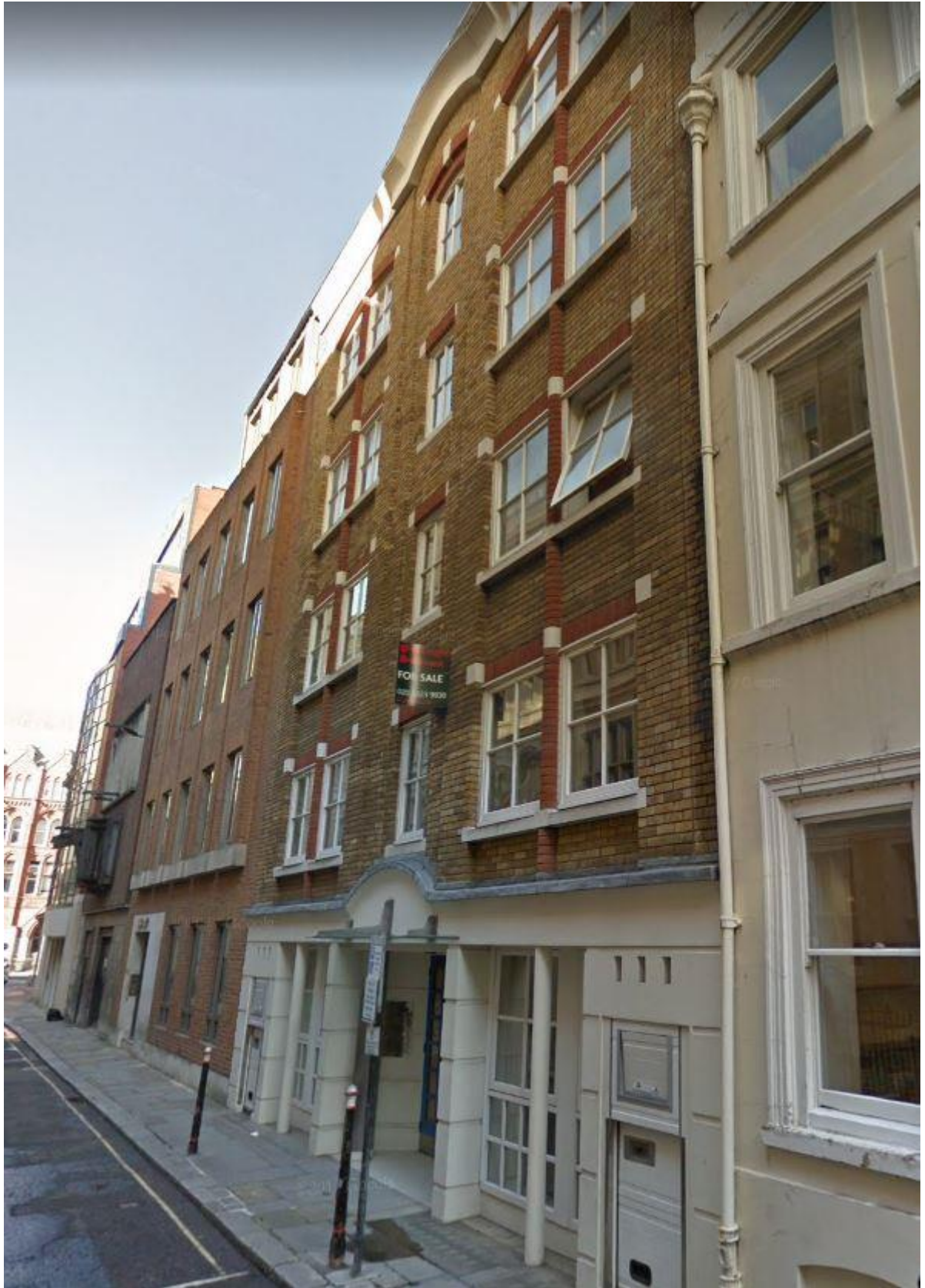
Front Elevation Looking North-East