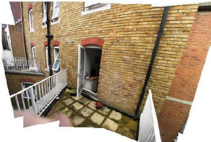
Terrace Looking West