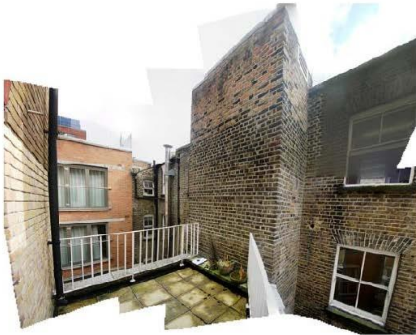
Terrace Looking Northeast