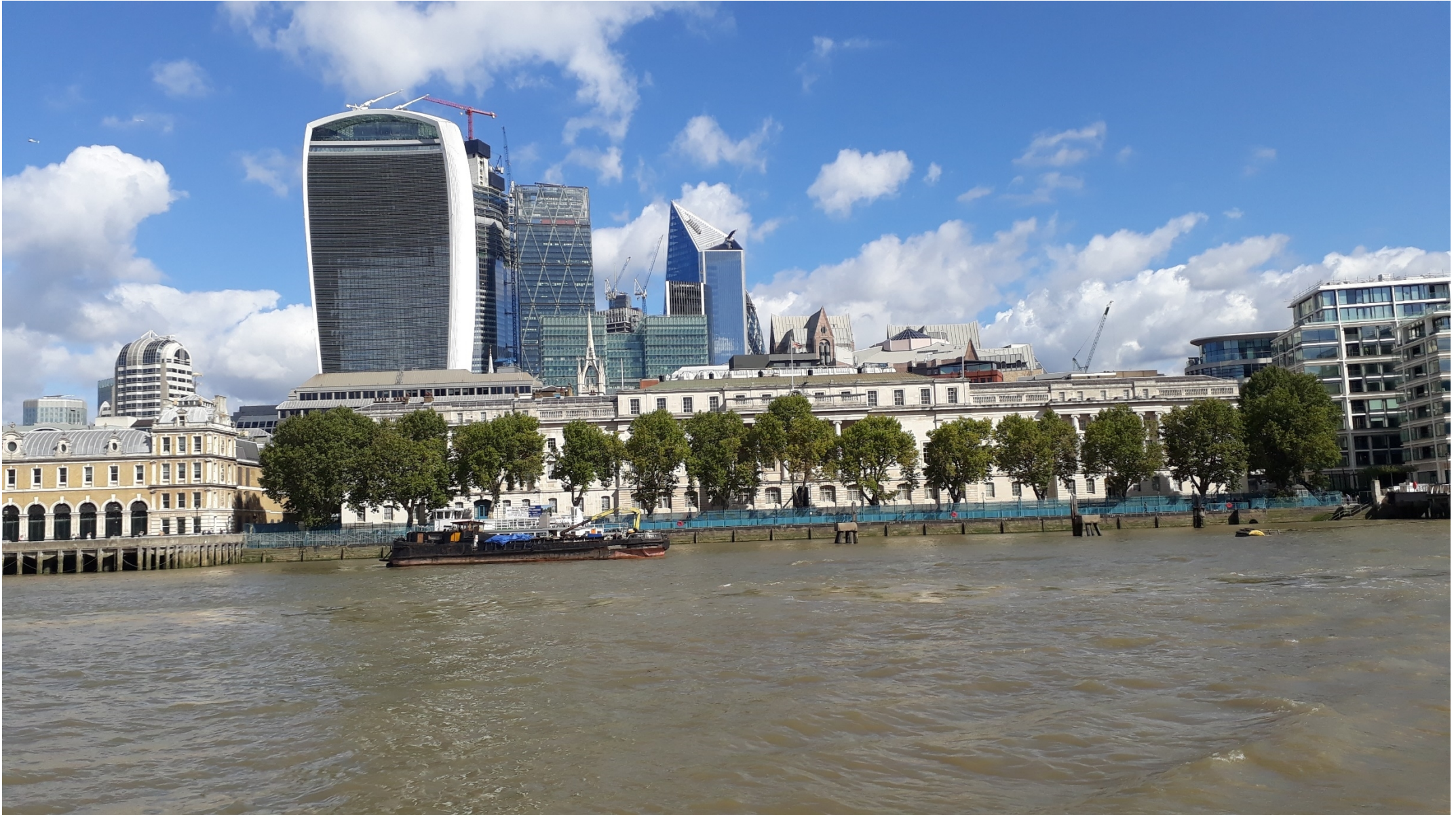
Photograph of trees from the river