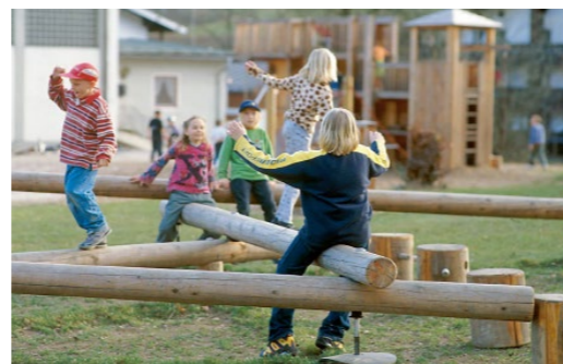
'Jack Straws' or 'Pick up sticks' climbing unit