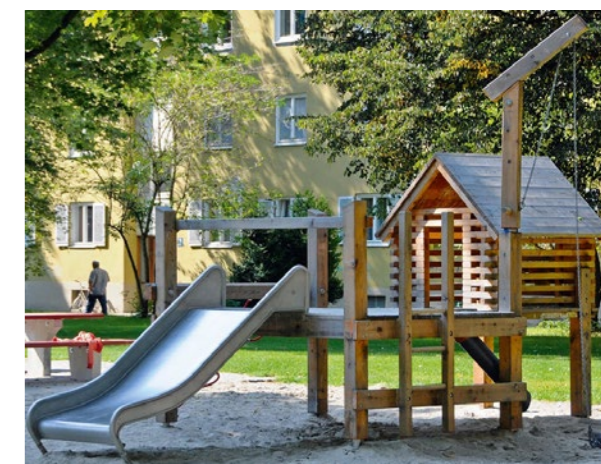
Other slide tower options