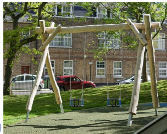
Toddler / cradle swings - existing re-used or new if budget allows