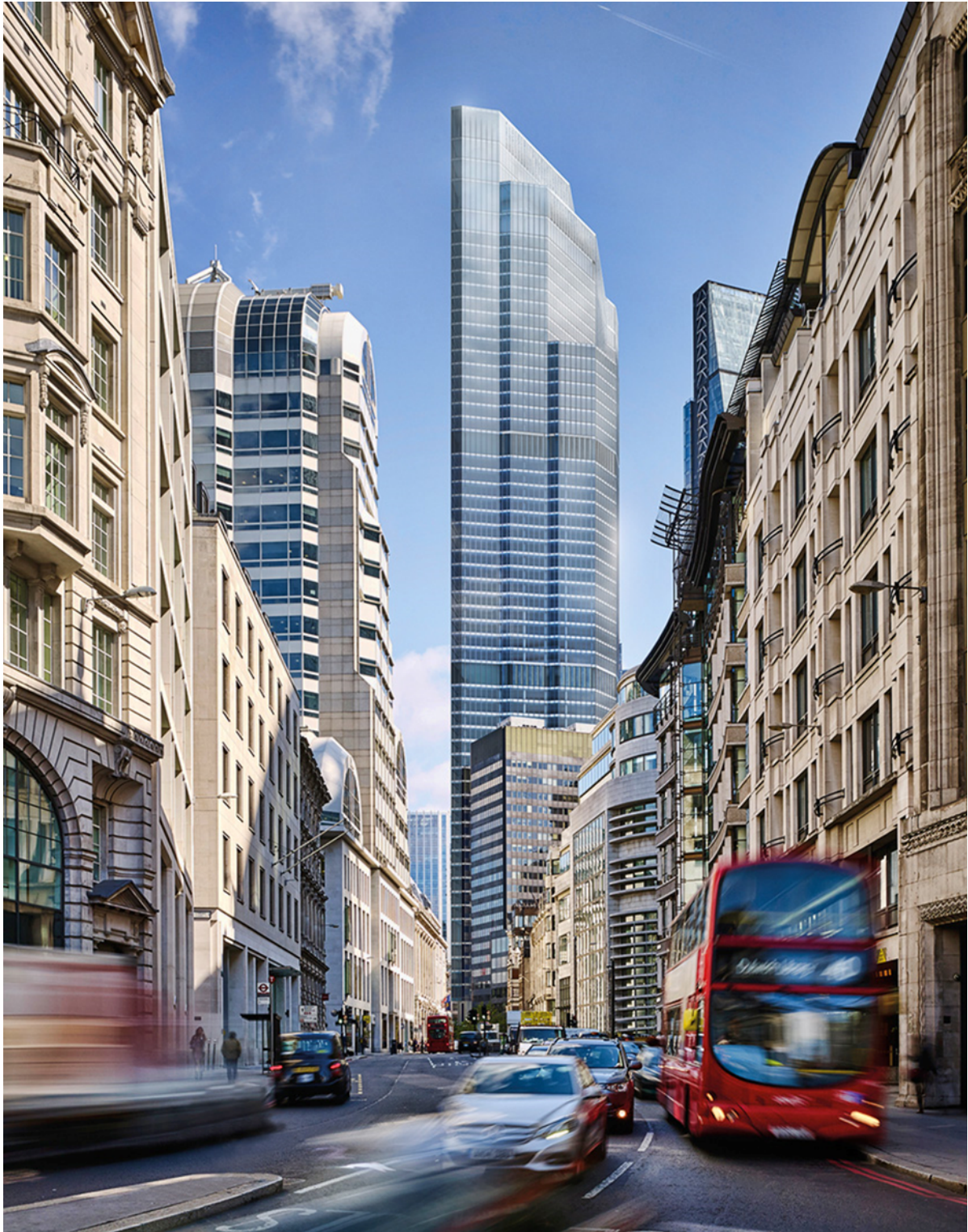
Appendix 2 –Image; Flank Wall 42-44 Bishopsgate, EC2