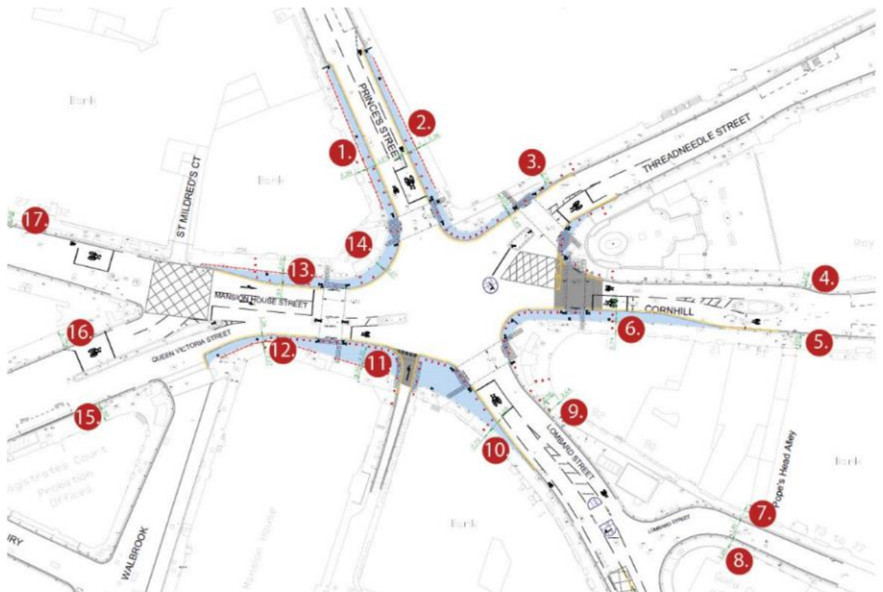
Figure 2 site reference plan for locations of Pedestrian comfort levels.