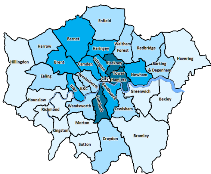
Wave 3 number of grants awarded per borough (darker = more grants)

The top five funded boroughs in Wave 1 & 2 were Hackney, Southwark, Lambeth, Islington and Camden. In Wave 3 they were Hackney, Tower Hamlets, Lambeth, Camden and Haringey, so a similar funding pattern broadly aligned to the IMD. If we compare the level of funding per borough in Wave 3 against the Indices of Multiple Deprivation (IMD) we can see that there was general alignment, but that there could be value in targeting specific boroughs more in future Waves.