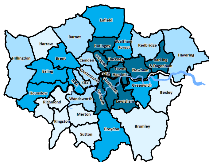
IMD per borough (darker= higher deprivation level)