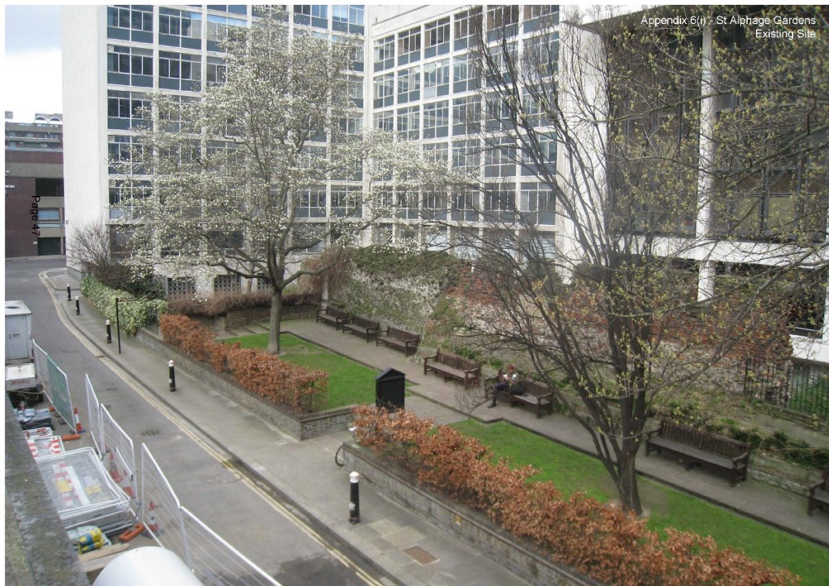
St Alphege Gardens before