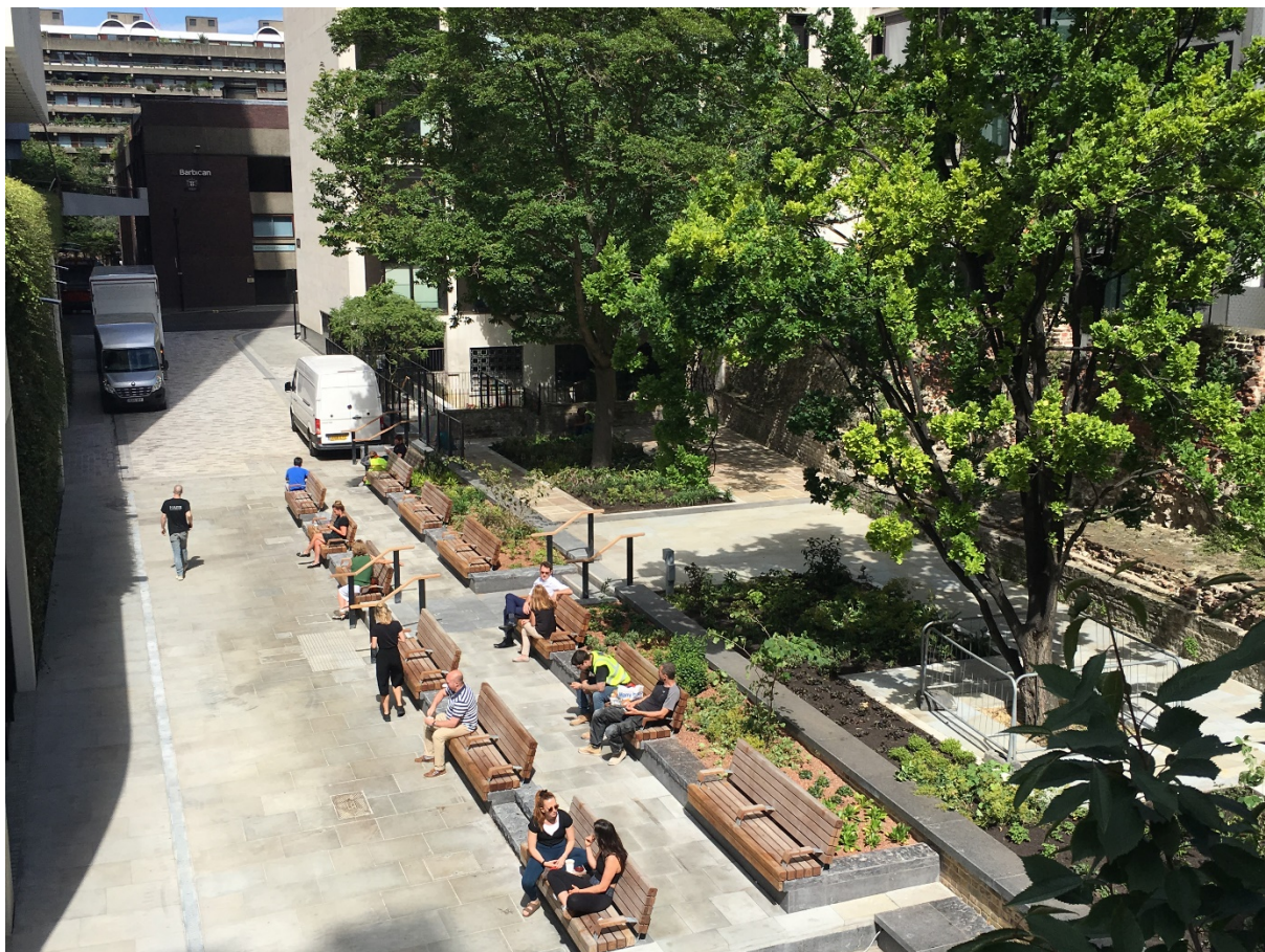
Use of the gardens increased significantly after it re-opened to public in summer 2019.