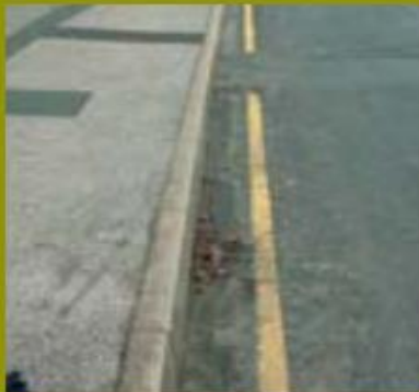
Grade B Predominantly free of detritus except for some light scattering