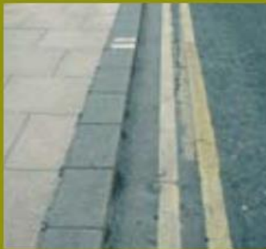
Grade A No detritus

Grade D: Heavily affected by detritus with significant accumulations