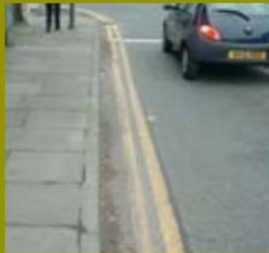
Grade C Widespread distribution of detritus with minor accumulations