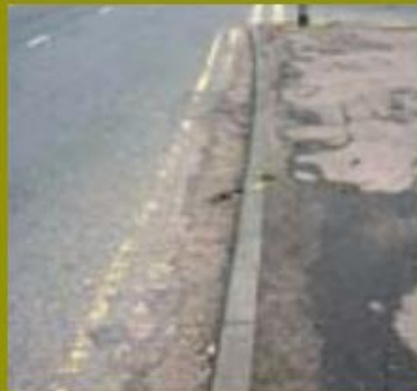
Grade D Heavily affected by detritus with significant accumulations