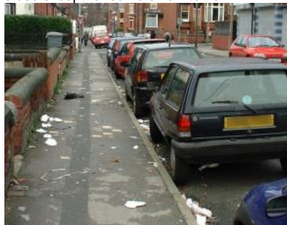
GRADE D - heavily littered, with significant accumulations