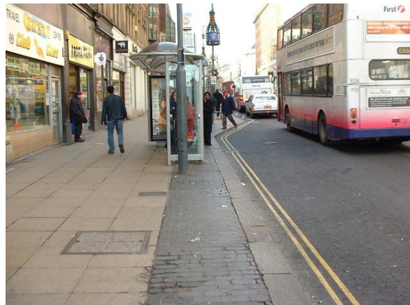
GRADE B - predominantly free of litter and refuse except for some small items