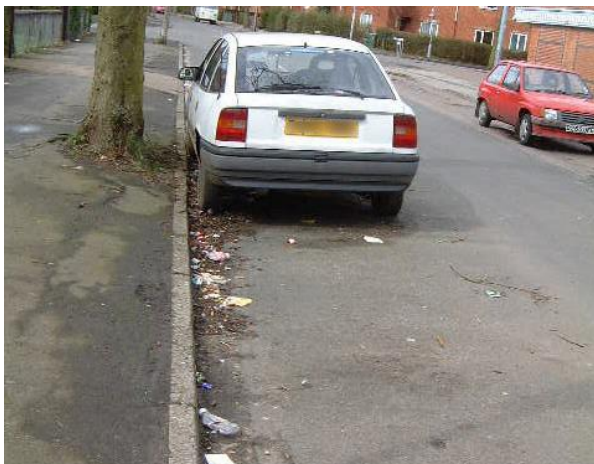
GRADE C - widespread distribution of litter and refuse, with minor accumulations