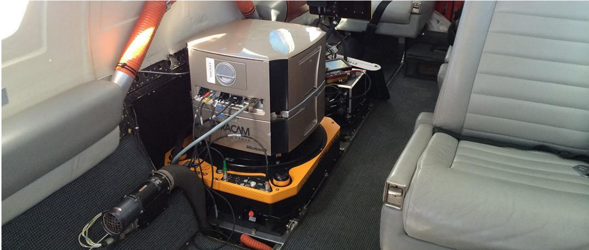
Figure 1 Photo of a survey-grade aerial camera with IMU in action