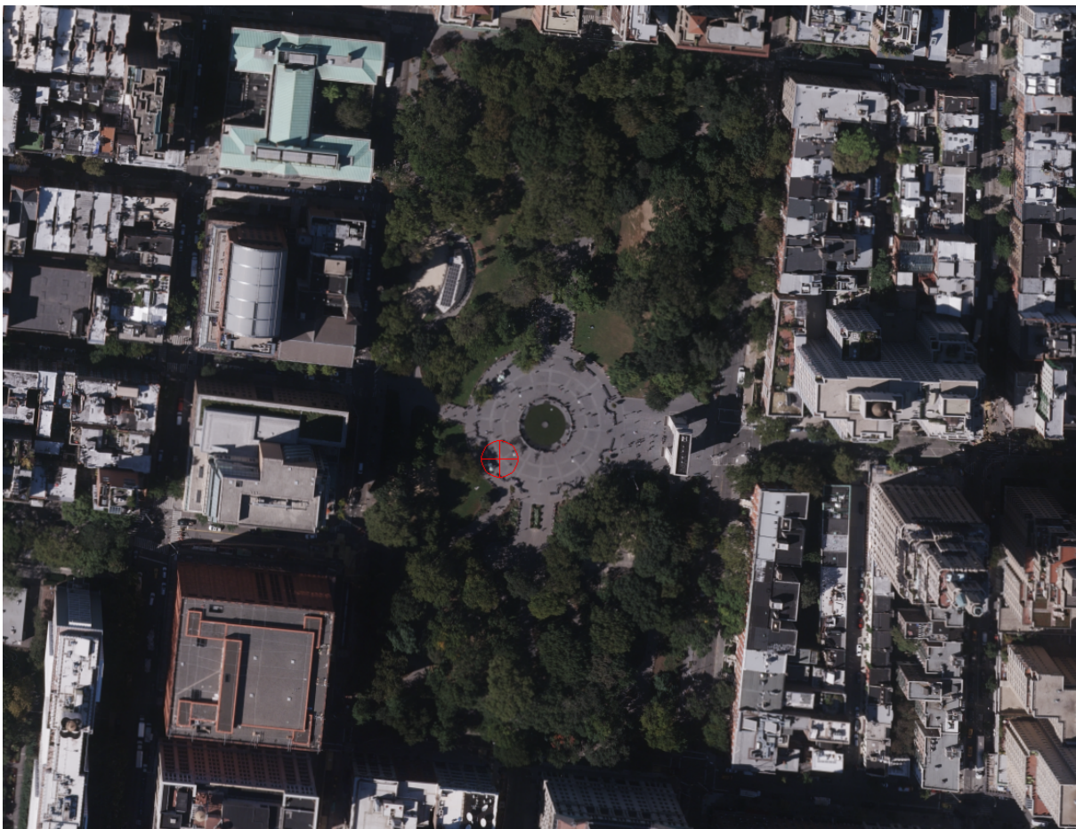
Figure 5 aerial image of the same site and the cursor points to the Ground Control Point.