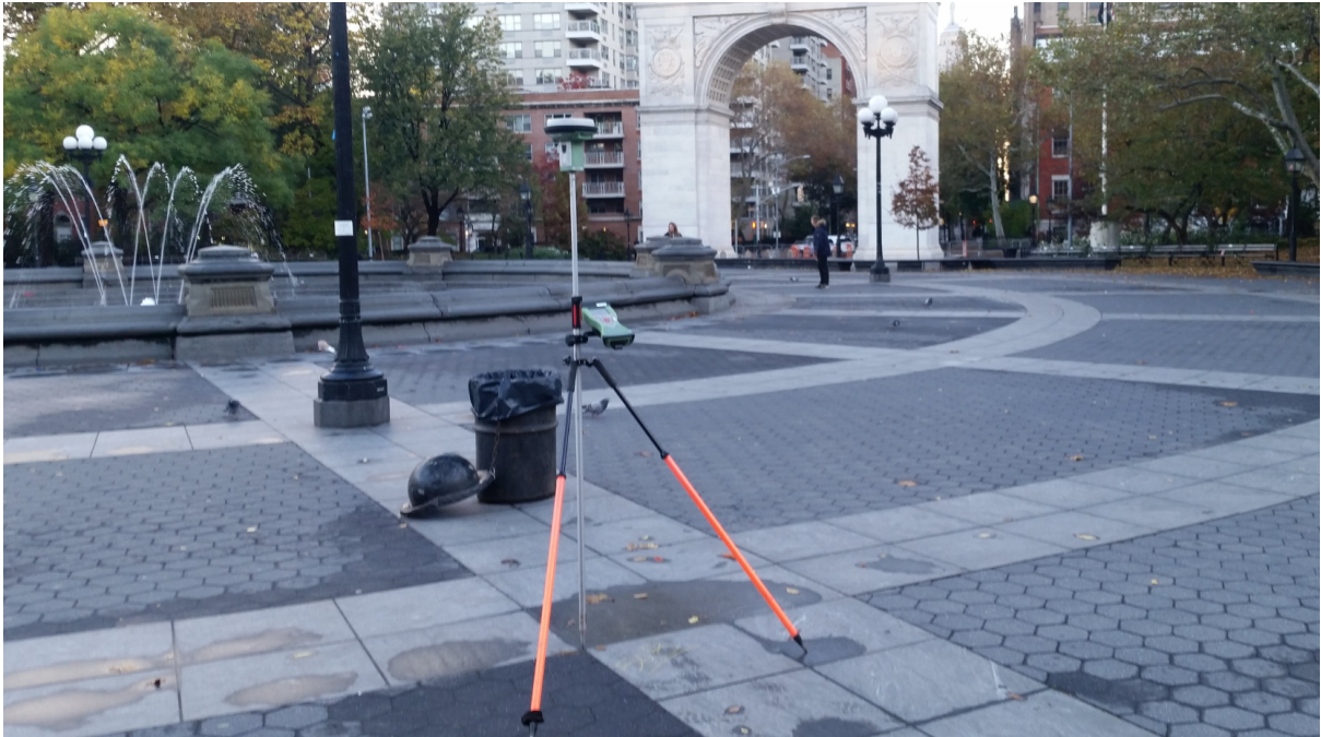
Figure 4 photo of recording a Ground Control Point with a GPS receiver.