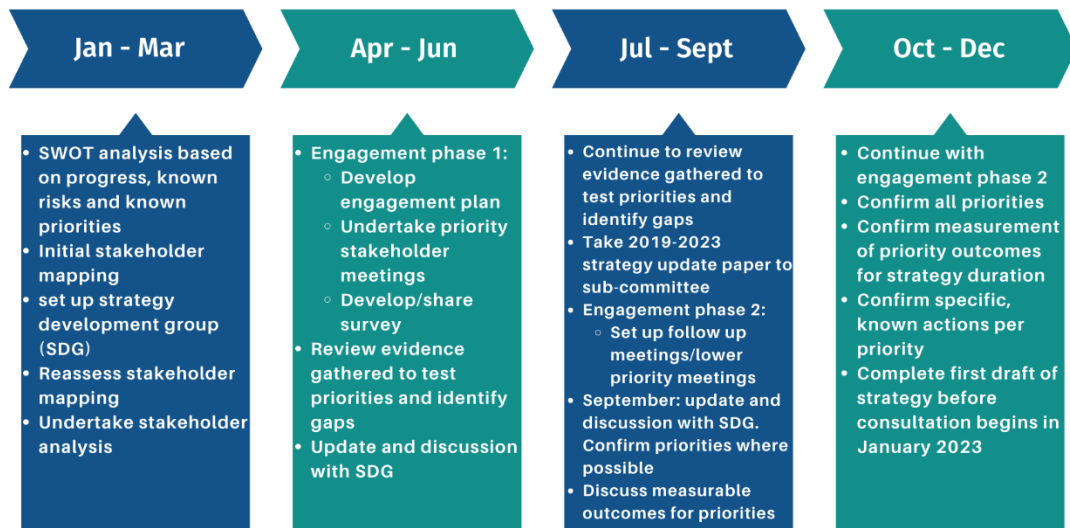
Figure 2 2022 strategy development timeline detail