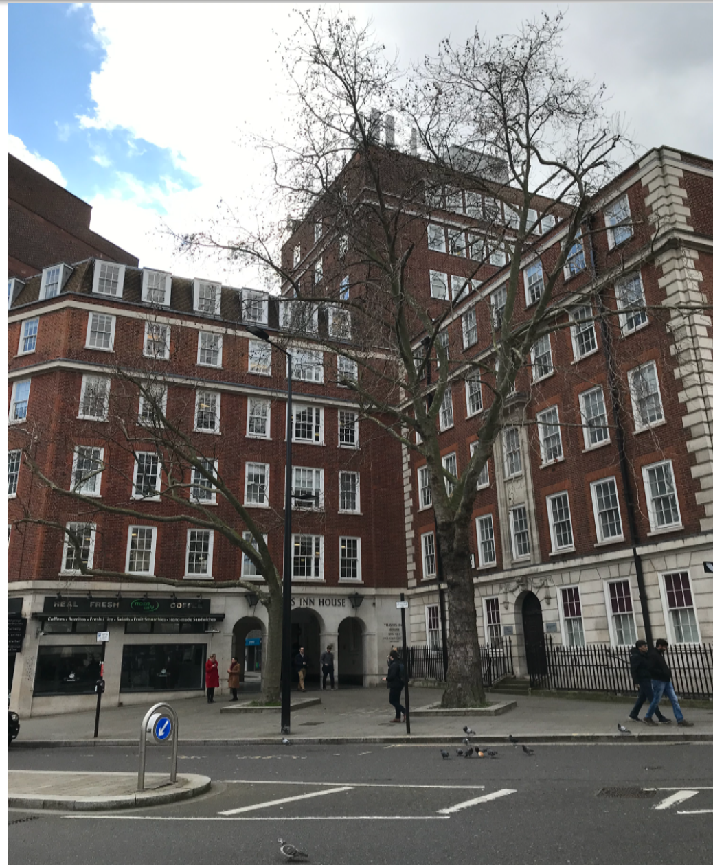
Photograph of trees