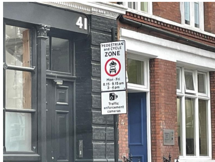
Figure 2 Closer up view of the 'No motor vehicle' sign on Charterhouse Square