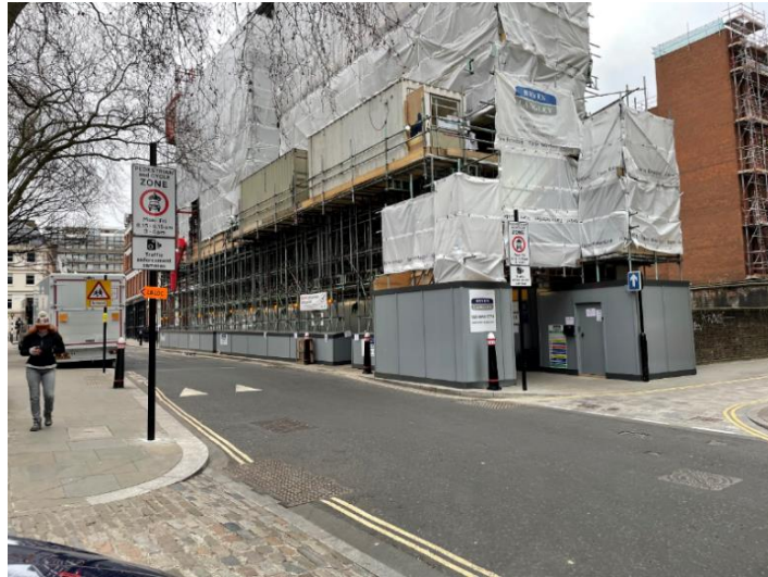
Figure 1 'No motor vehicles' signs arranged to form a 'gateway' on Charterhouse Square