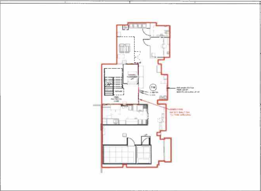
C2 LICENSING PLAN - BASEMENT 1:50

leonard design architects 110, 112, 114, 116, 118, 120, 122, 124, 126, 128, 130, 132, 134, 136, 138, 140, 142, 144, 146, 148, 150, 152, 154, 156, 158, 160, 162, 164, 166, 168, 170, 172, 174, 176, 178, 180, 182, 184, 186, 188, 190, 192, 194, 196, 198, 200 EN7164 ADDRESS 48 & 5 BLOMFIELD STREET, LONDON, EC2M 7AY Scale: 1:50 DATE: 12/20/2024 PROJECT: EN7164 REVISIONS: NO. DATE DESCRIPTION Scale: 1:50 DATE: 12/20/2024 PROJECT: EN7164