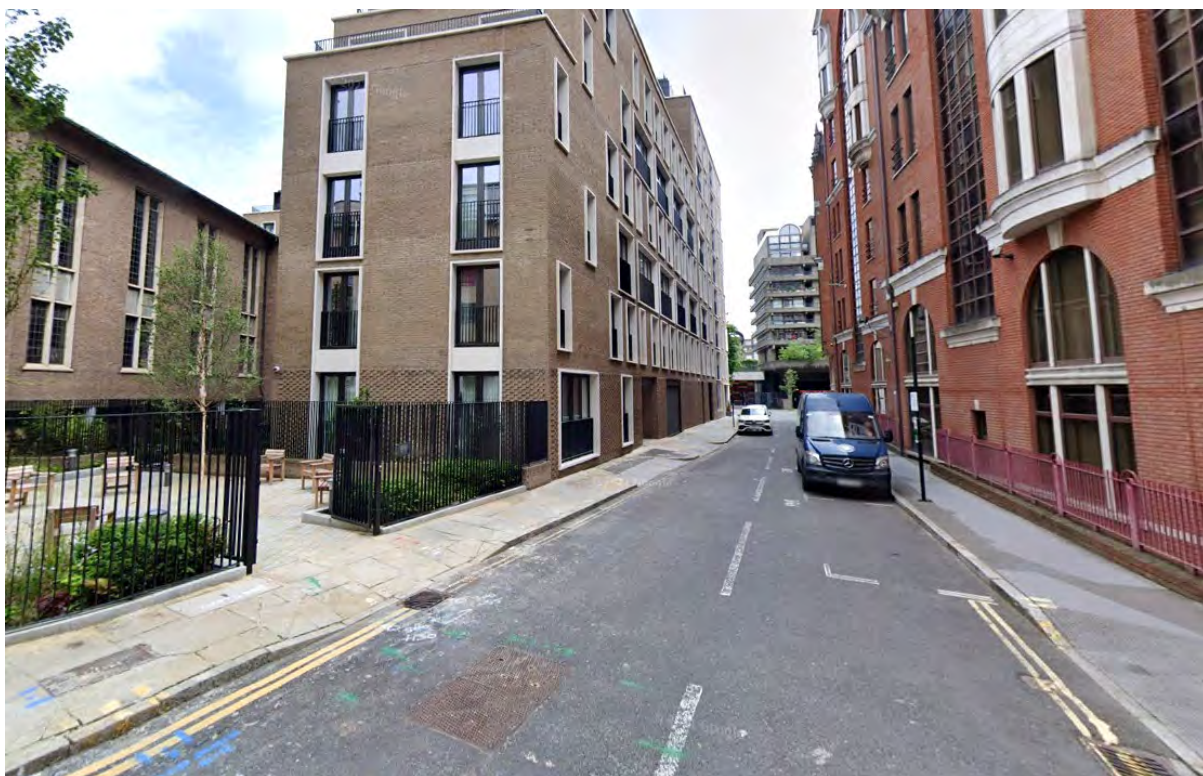
Before: Brackley Street looking east.