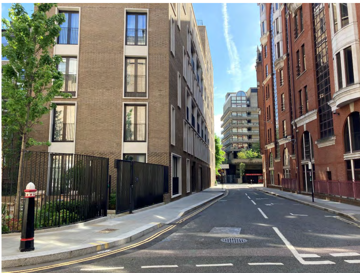
After: Brackley Street looking east. The north footway was repaved in Yorkstone