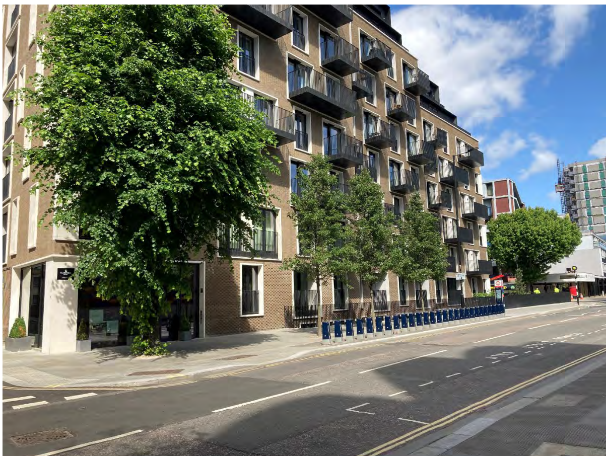
After: Golden Lane looking north-west. The footway was repaved in Yorkstone and the cycle hire docking station realigned.