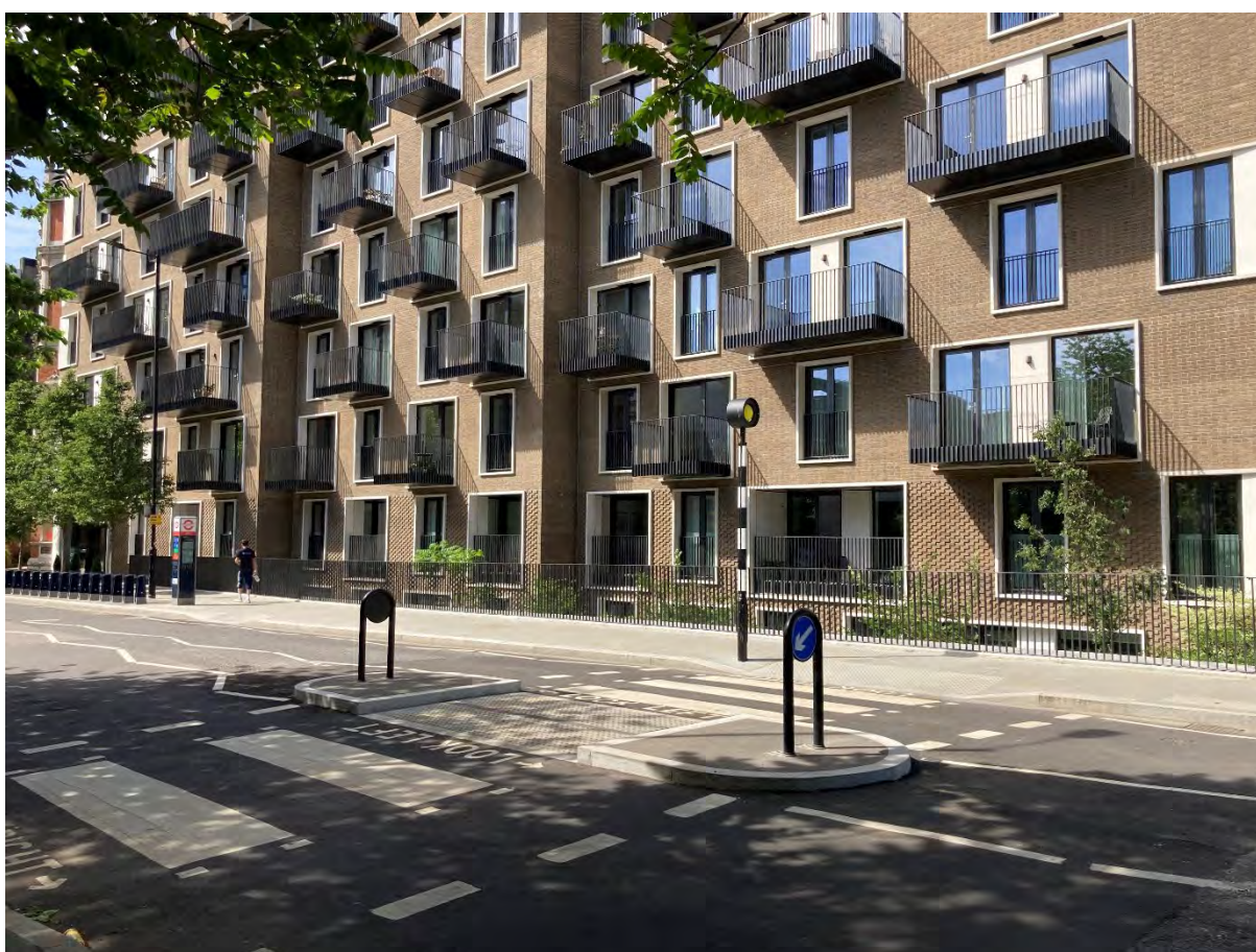
After: Golden Lane looking south-west. The zebra crossing was realigned and repaved.