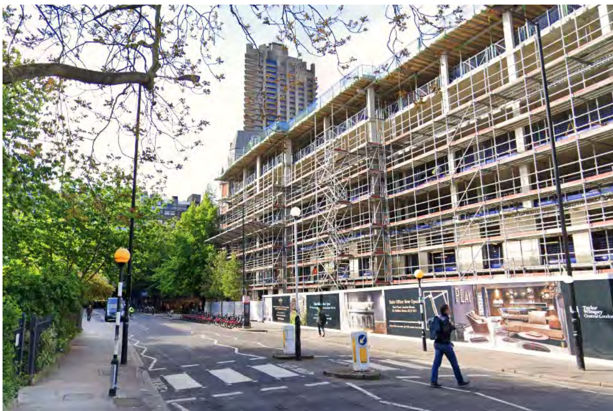
Before: Golden Lane looking south-west