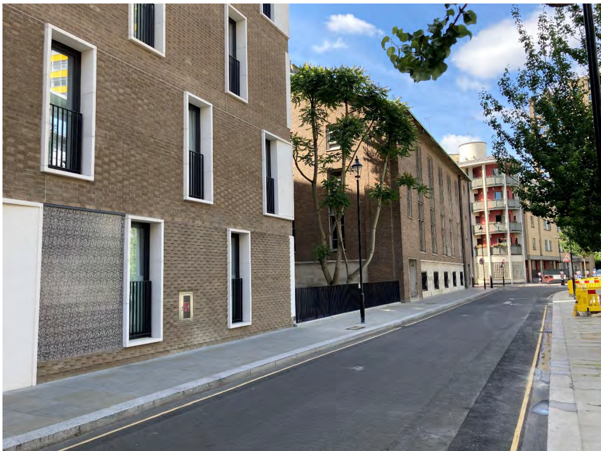
After: Fann Street; the footway adjacent to the development and the church was paved in Yorkstone.