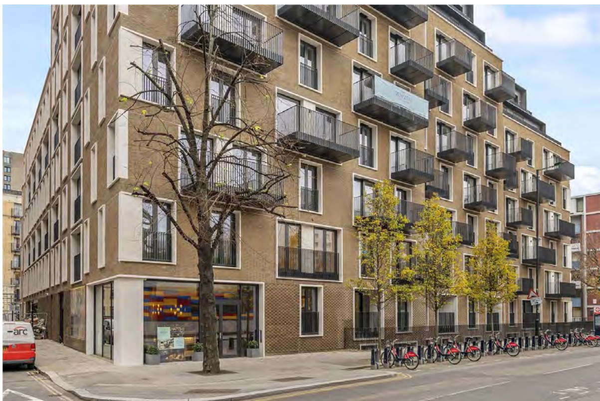
Before: Golden Lane looking north-west