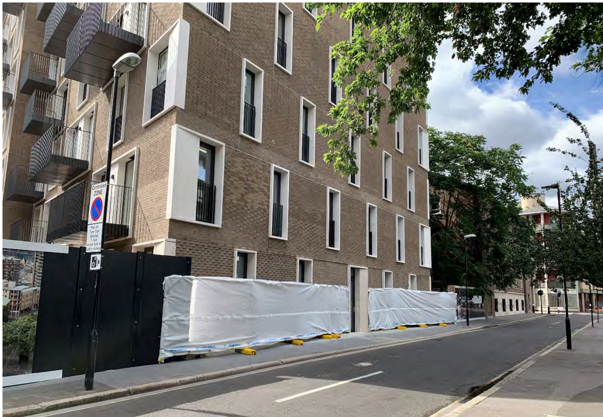
Before: Fann Street looking west from Golden Lane