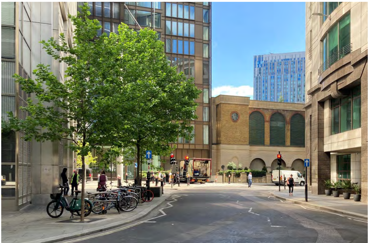
After: The pedestrian crossing on Outwitch Street was realigned.