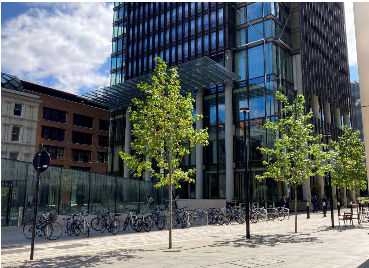
After: Trees were replaced and cycle parking provisions were introduced in newly paved area of Houndsditch.