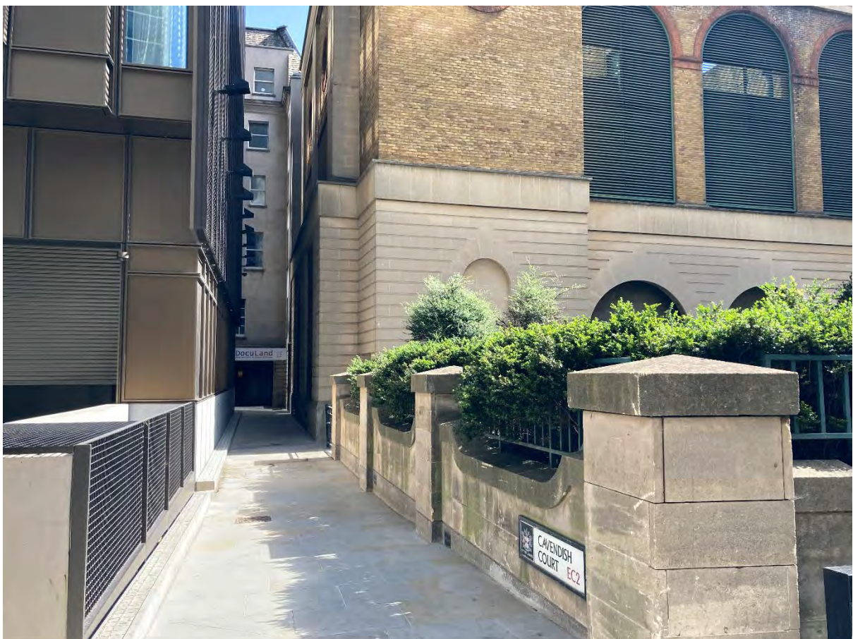
After: Cavendish Court repaved in Yorkstone