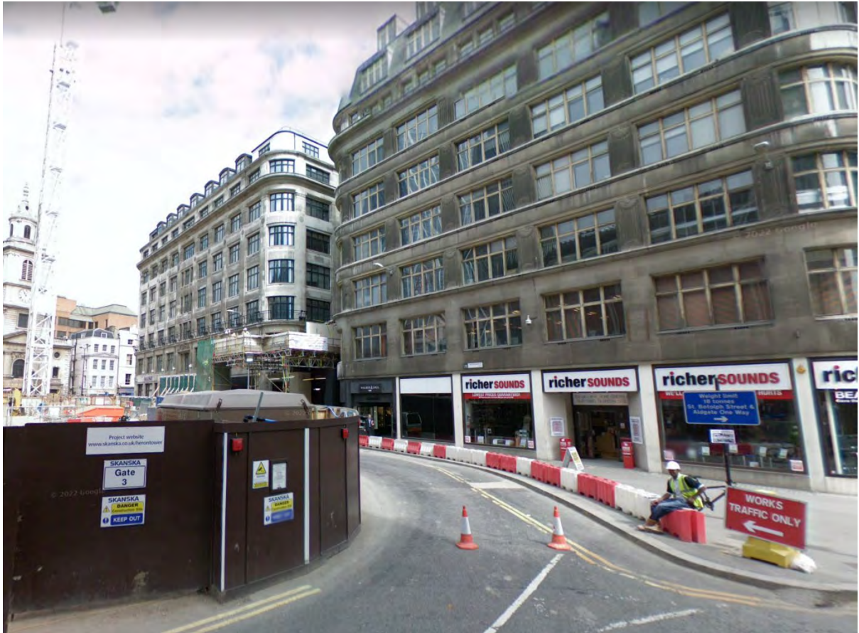
Before: Houndsditch looking north towards Bishopgate