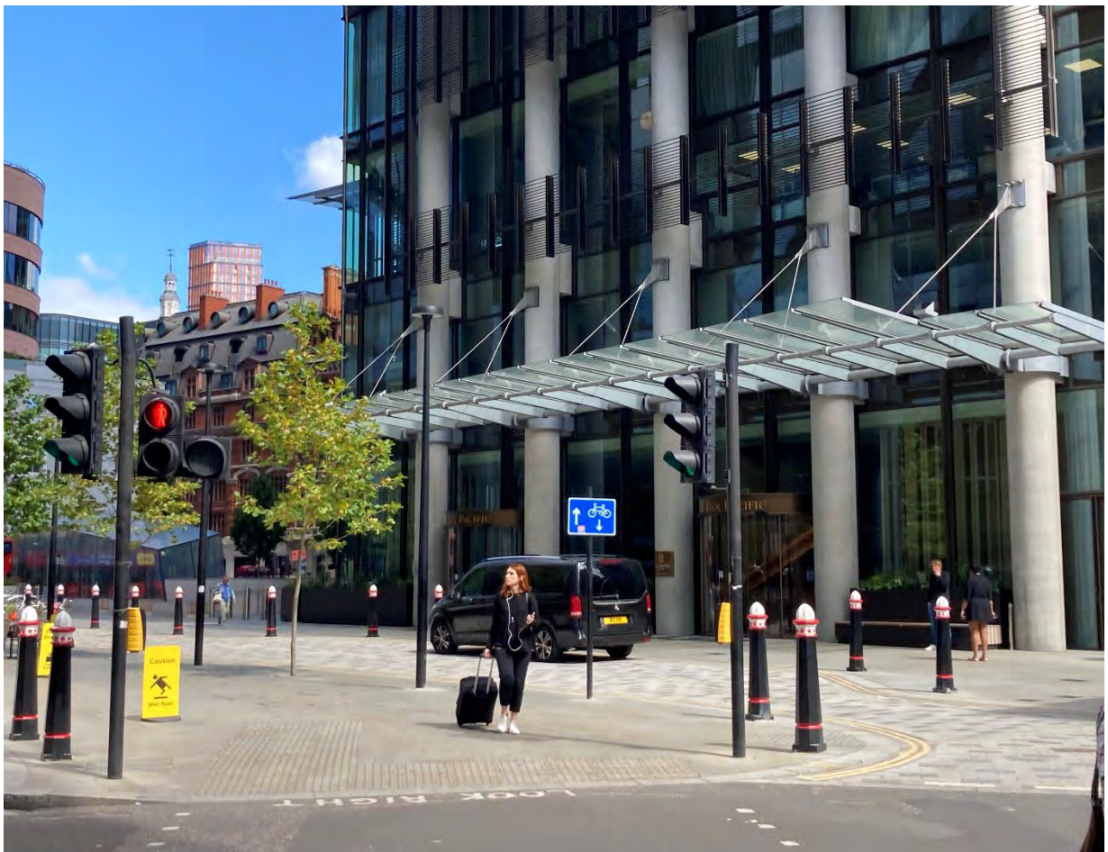
After: The raised carriageway in granite sets on Houndsditch.