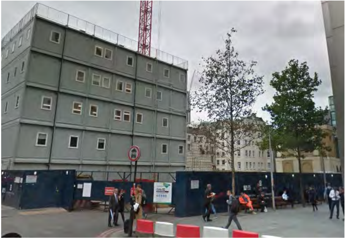
Before: Construction site at 150 Bishopsgate looking south-north from Bishopsgate