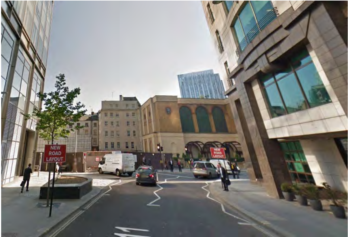
Before: Junction of Outwitch Street and Houndsditch