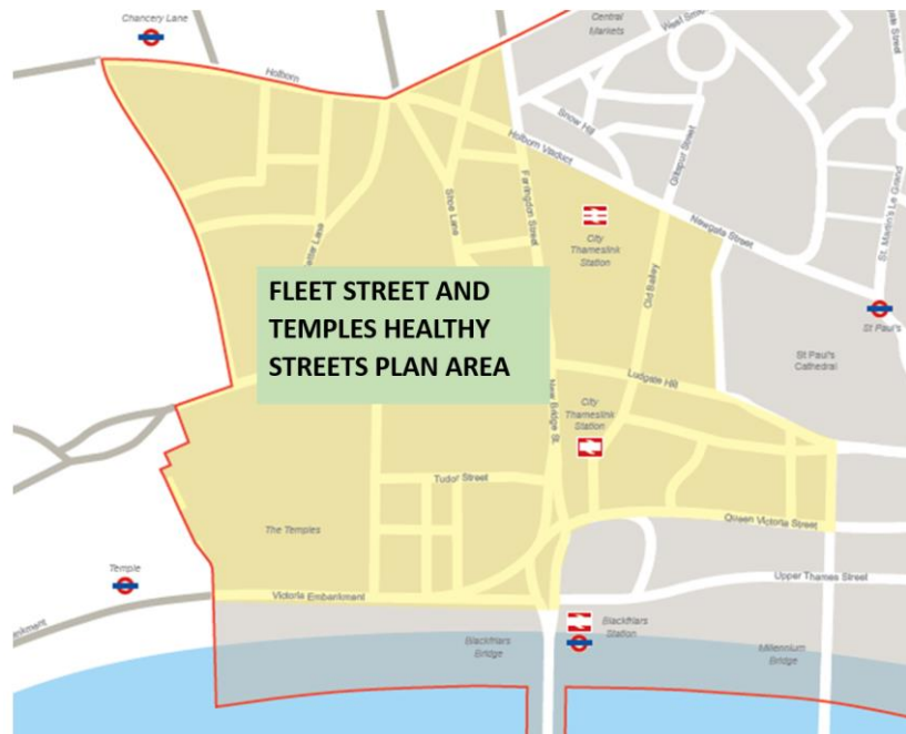
Figure 2: Revised Fleet Street Area Healthy Streets Plan