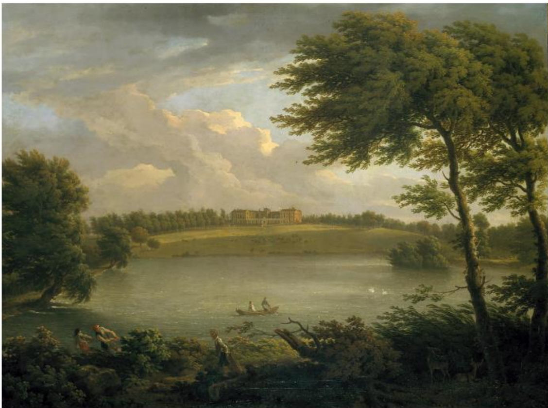
George Lambert and Francis Hayman, 'View of Copped Hall in Essex, from across the Lake', 1746, © Tate, Photo © Tate, image released under Creative Commons CC-BY-NC-ND (3.0 Unported), (available from 'View of Copped Hall in Essex, from across the Lake', George Lambert, Francis Hayman, 1746 | Tate )