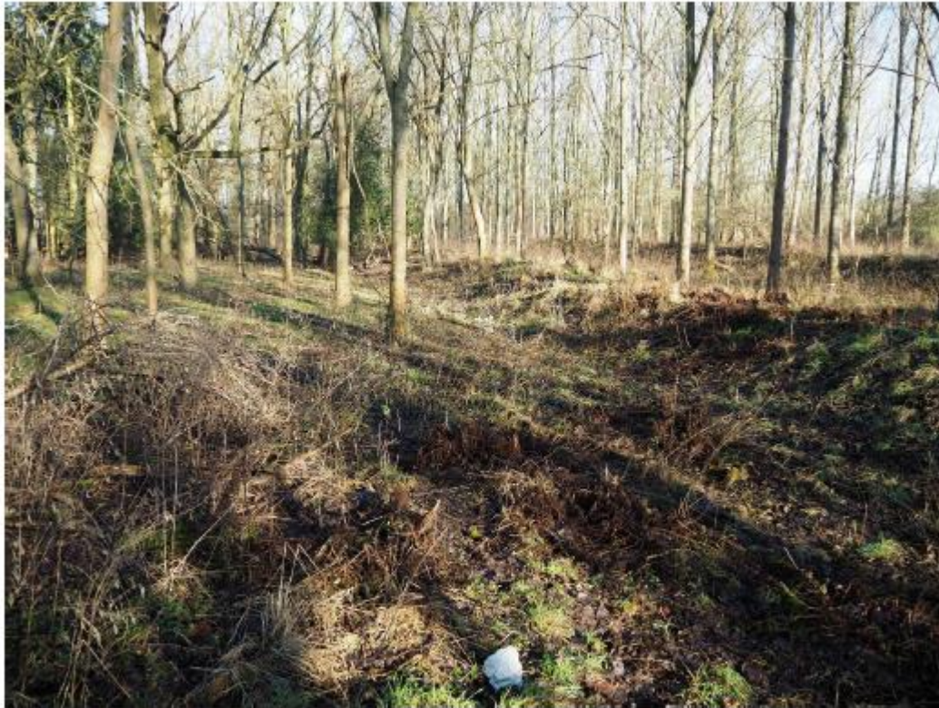
Ditch [10] from the south with the banks of Canal Pond [9] visible beyond. Note that in part, the long fall to the left is natural (Magnus Alexander, January 2022, © Historic England)