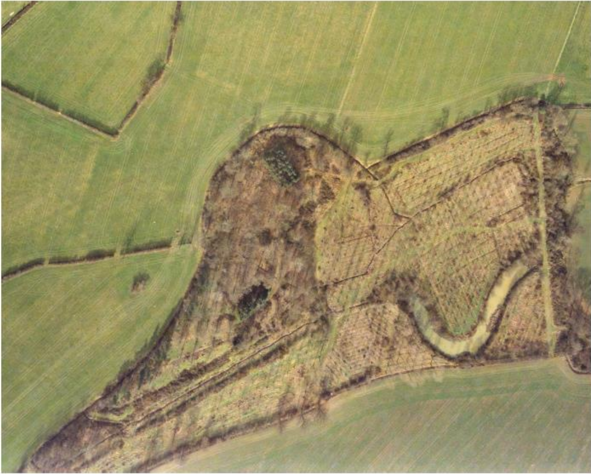
The northern part of Rookery wood in March 1991 (north to upper right) showing the poplar plantation across Square Pond a few years after planting (EA AF 91C 004 V 1875 03 MAR 1991)