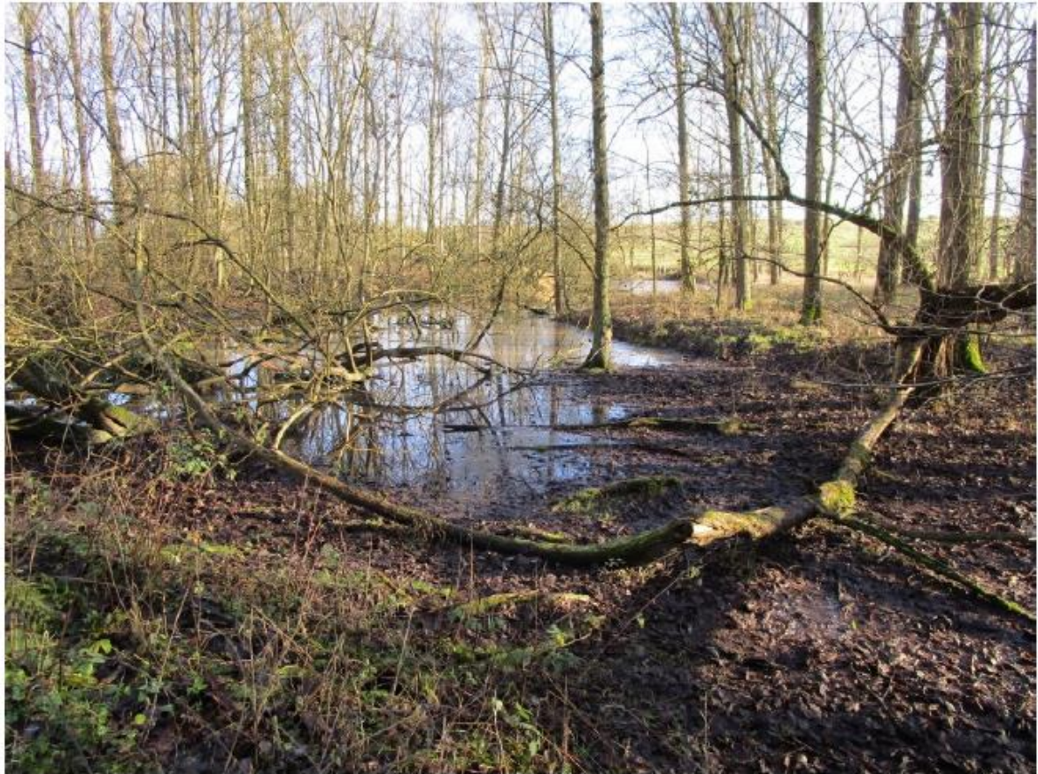
Figure 4. The serpentine pond in 2017. There was a lot less water in October 2022. The very straight poplar trees can be seen in the background.