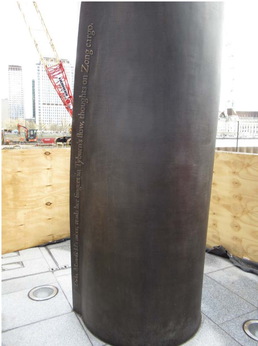
Vent 1 Victoria Embankment Foreshore (Tyburn Quay), bronze.

2.2.4 Below is an image of the bronze columns for the Tideway Victoria Embankment Foreshore site recently installed, and Putney Embankment – which show the same font and font size as proposed for Bazalgette Embankment and how these will look once installed.