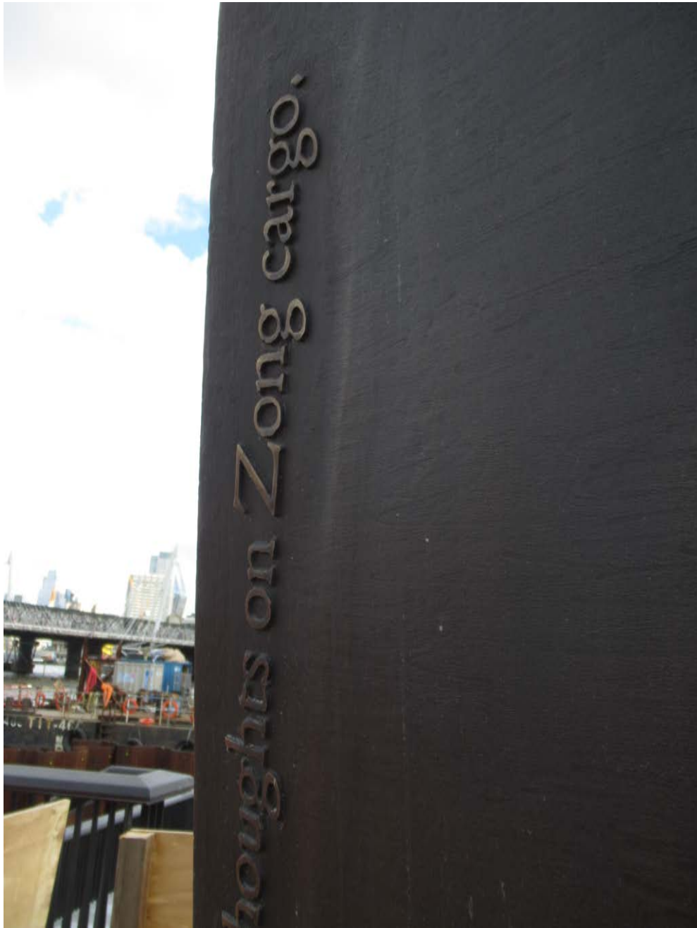
Vent 1 Victoria Embankment Foreshore (Tyburn Quay) - detail