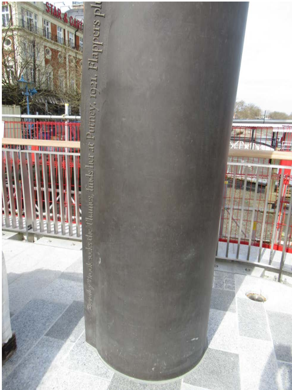
Putney Embankment (bronze)