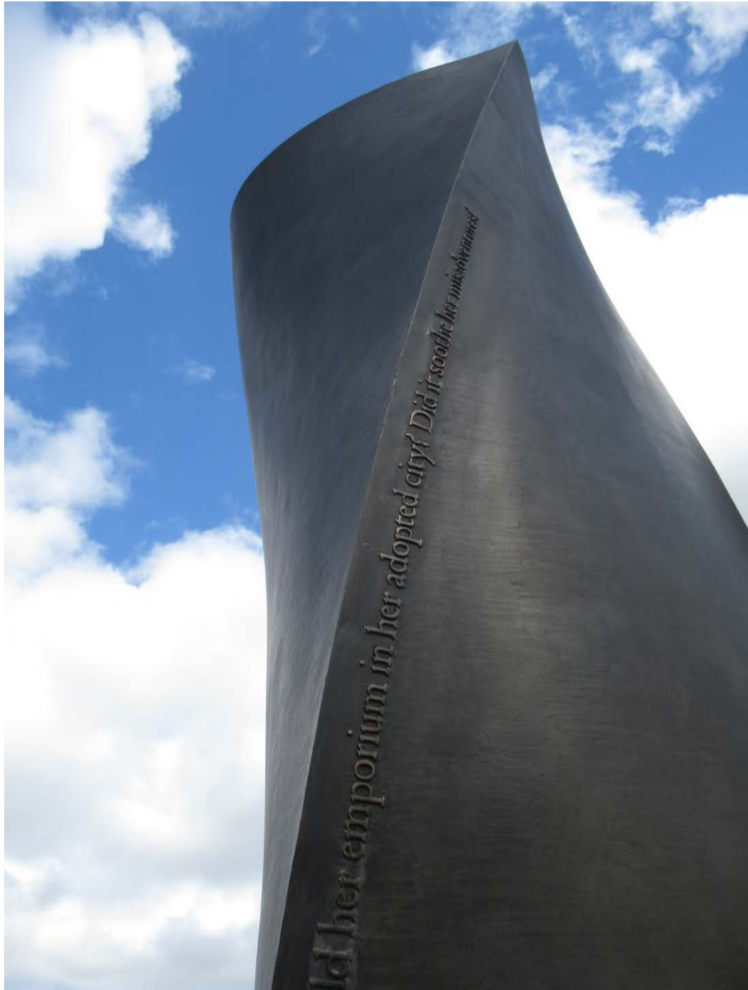
Vent 2 Victoria Embankment Foreshore (Tyburn Quay)