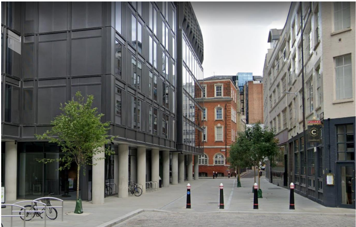
A new pedestrian and cycle zone was created and eight trees were planted