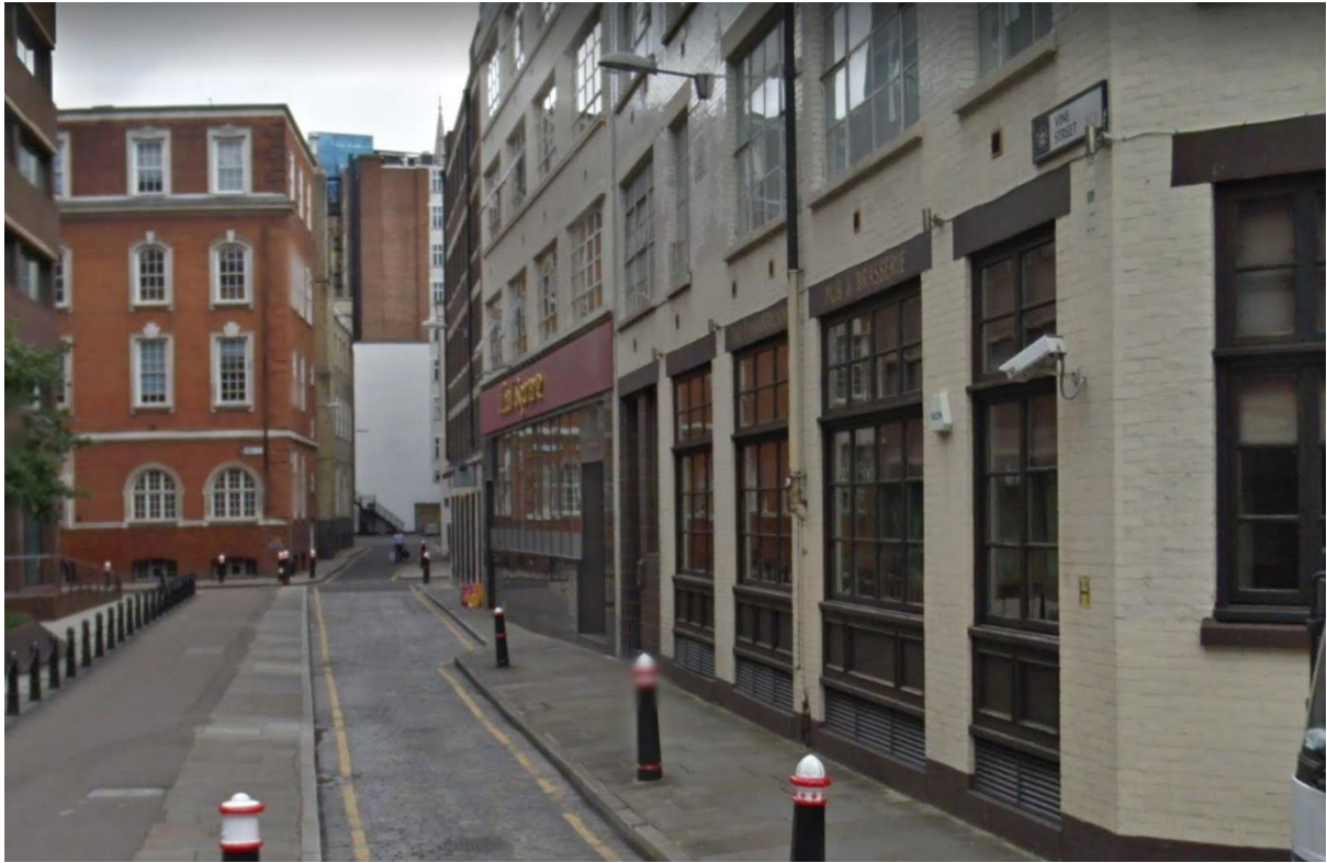
The carriageway enabled vehicles to travel north