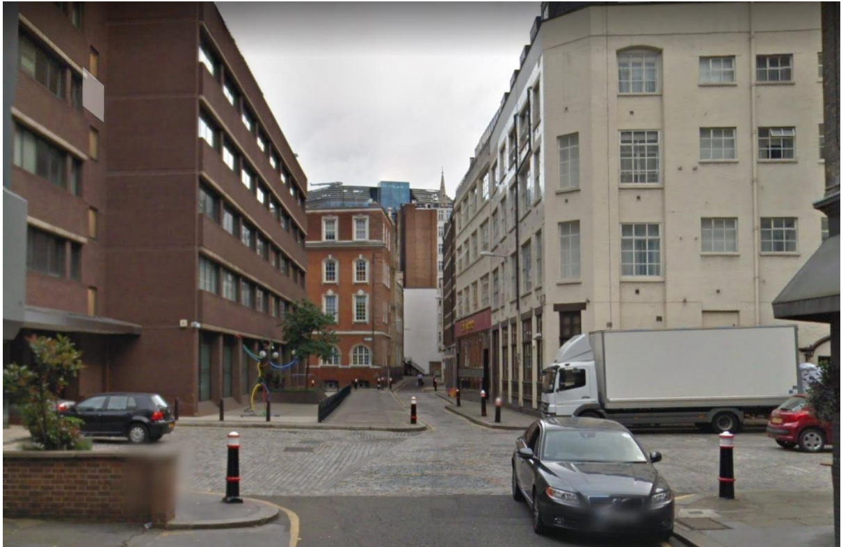
Looking north up Vine Street before