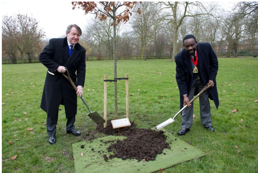
Tree Planting Ceremony in Queen's Park