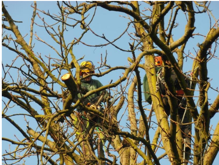
Tree Works in the Park