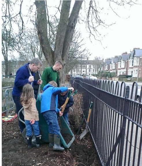
Hedge Planting in the Play Area