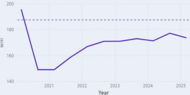
Kg of General Waste per household (NI191)