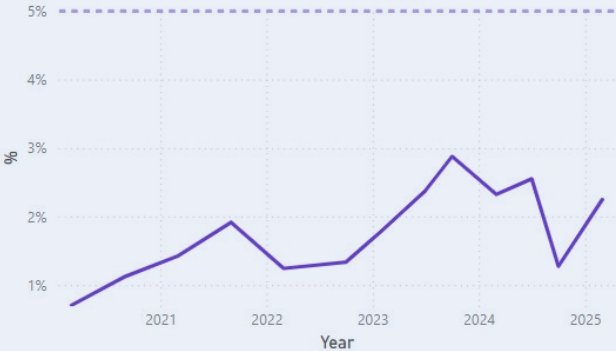
Local Environmental Quality - Overall % (NI195)