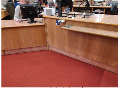
DDA compliant reception desk & Walking Aid holder