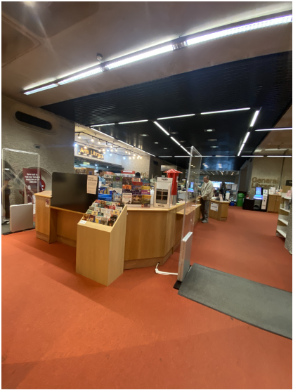
Existing Returns desk

Route from lift to community space is level