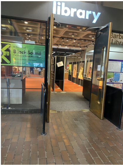
Existing Entrance Doors