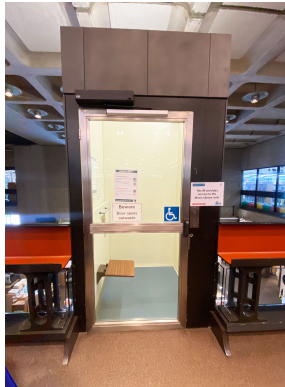
Existing platform lift to lower level