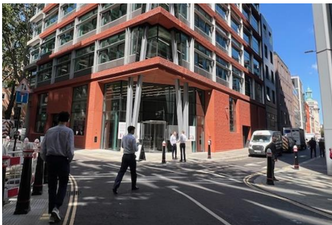
6 The junction of Breame Buildings and Fetter Lane after the improvements