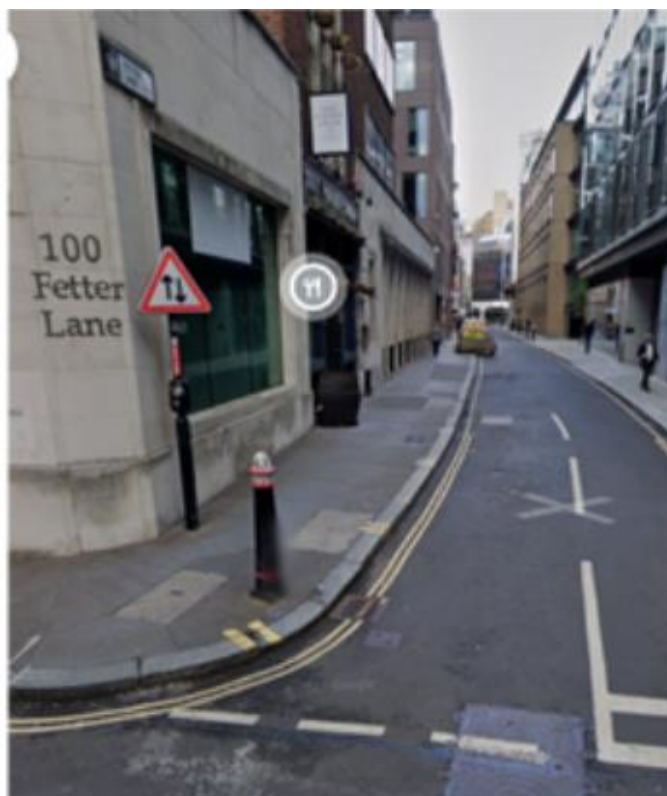
1 Fetter Lane looking north prior to the improvements.