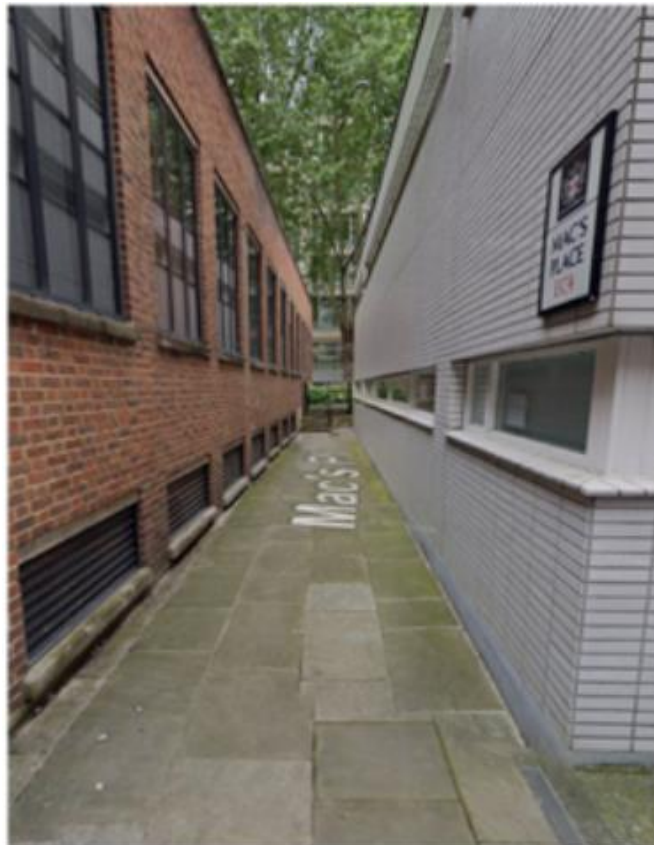
3 Macs Place looking south prior to the improvements