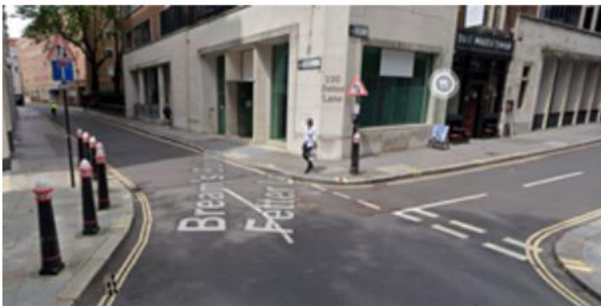
5 The junction of Breame Buildings and Fetter Lane prior to the improvements.