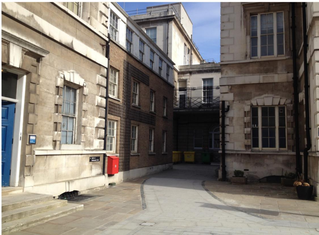
Case No. 14/00319/FULL & 14/00320/LBC St. Bartholomew's Hospital North Block from Hospital Square