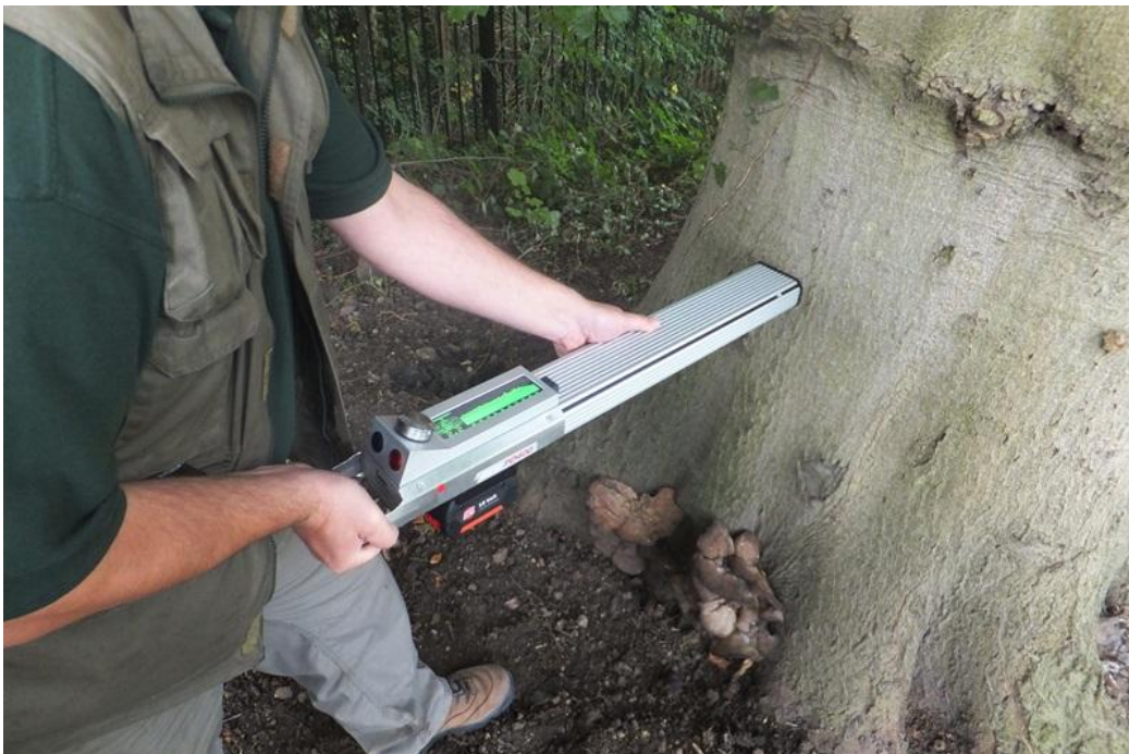
Figure 2: Resistograph being used to test for internal decay

19. Members of the Tree Team have developed their skills and experience in carrying out detailed tree assessment over the past six years, and can now employ a variety of technical investigatory procedures that can determine structural integrity and the extent of decay in older or damaged trees. They can employ a micro drilling device called a Resistograph, which provides an instantaneous visual display of the internal structure of the branch or stem being assessed. This device allows the Team to determine the 'residual wall' strength of the tree and make decisions on whether the tree requires a crown reduction or other suitable management. The acceptable rule of 30% of the known radius of the tree's main stem is considered to be the optimum wall thickness, but there are exceptions to this guidance, depending on age and species.