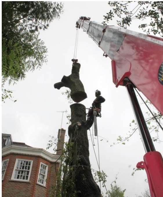
Figure 5: Dismantling of a field boundary oak

21. Figures 4 and 5 above show lifting and lowering operations undertaken by the Tree Team over the past twelve months. Figure 4 involved a light crown reduction on a veteran oak at the bottom of the Tumulus Field, using the Highgate Wood hydraulic work platform. Figure 5 shows the Team working on an old field boundary oak in Golders Hill Park, which required dismantling using a 'spider' crane. The Team has started to use both types of equipment with greater