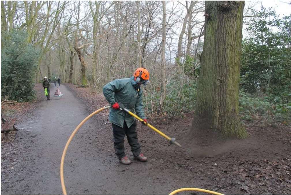
Figure 3: Oak tree root investigation at Highgate Wood