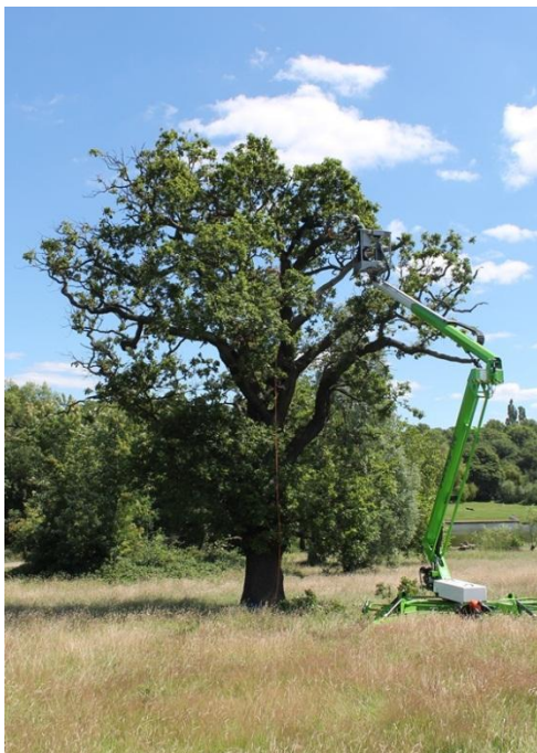
Figure 4: Veteran oak crown reduction