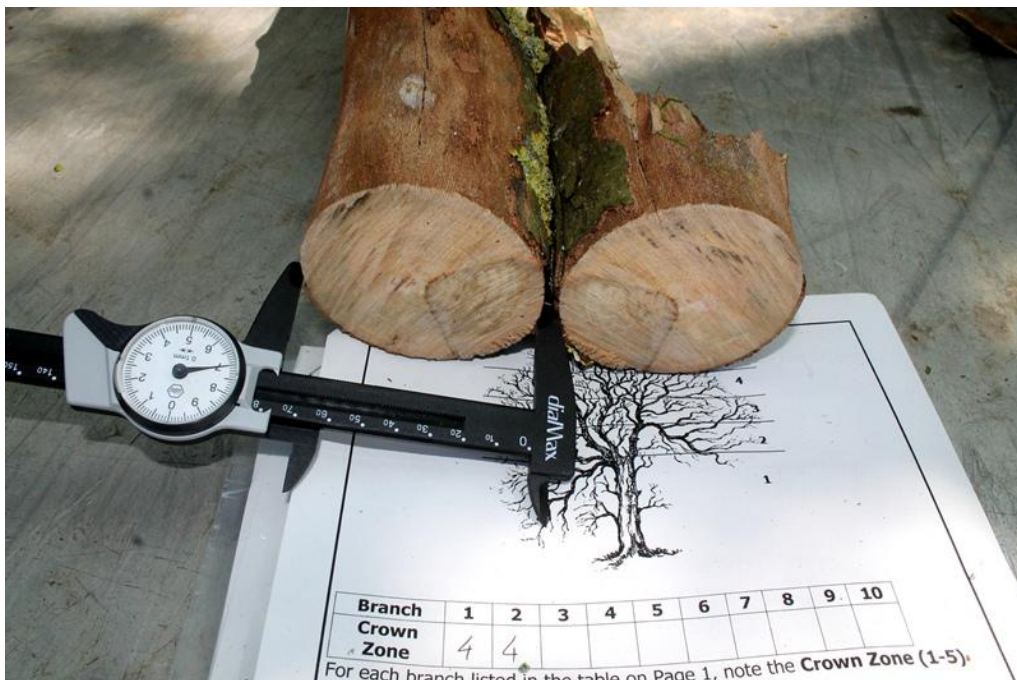
Figure 6: Branches with Massaria

23. The Tree Team actively inspects populations of oak, London plane, ash and horse chestnuts for the presence of Oak Processionary Moth, Massaria, ash dieback, and horse chestnut bleeding canker. Records are kept of findings and then transferred to a series of maps that plot the extent of each respective disease. Trees that are sited in the high and medium zones are numerically prioritised and are subject to annual walk-over inspection by the Tree Team. Massaria of Plane remains a significant operational focus for the Tree Team, with established infection sites at South End Green and Queen's Park.