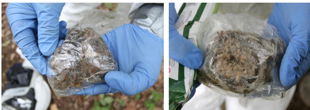
Figures 15 & 16. Author's own images of removed nests

22. The identified nests are removed and put into sealed double-skin plastic bags, which are placed into a container and then taken off-site for incineration. Figures 15 and 16 show nests containing the hairs at different stages of pupation, taken from trees no more than 50 metres apart.