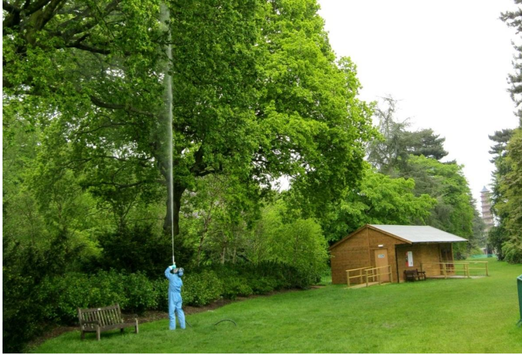
Figure 17. OPM spraying at Kew gardens

24. The Tree Team will continue inspections of areas deemed to be at risk, based on the previous year's inspection areas, the nest location map, the jogger's route map, FC inspectors' discoveries, plus public and staff reports. The Team will continue with the removal of discovered nests, and with staff presentations in the field showing nests, caterpillars and browsing.