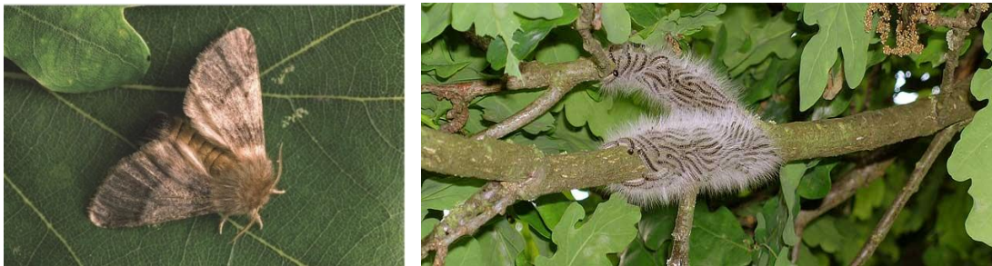
Figures 1 & 2. Forestry commission images of moth and caterpillars