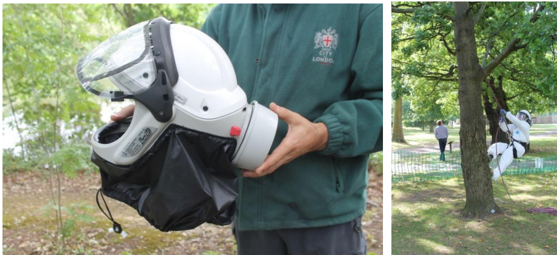
Figures 13 & 14. Images of specialist PPE

22. The identified nests are removed and put into sealed double-skin plastic bags, which are placed into a container and then taken off-site for incineration. Figures 15 and 16 show nests containing the hairs at different stages of pupation, taken from trees no more than 50 metres apart.