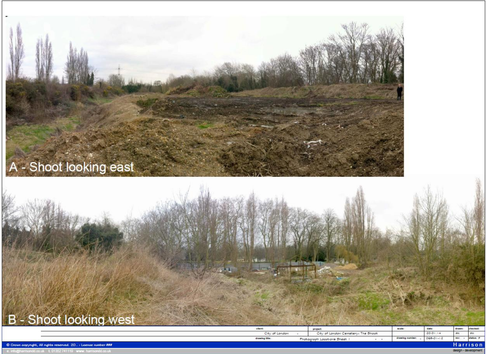
A - Shoot looking east