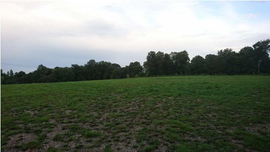
Looking east showing embankment and plateau