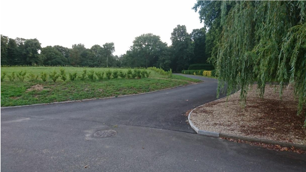
South west corner with altered road layout