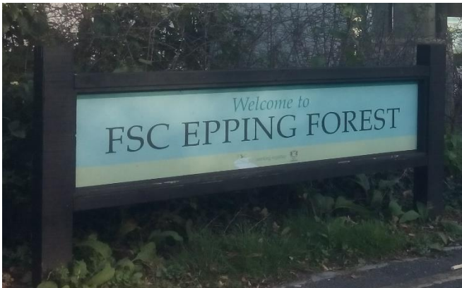
New signage in the car park & in classrooms