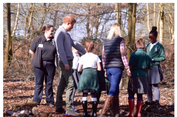
QCC visit March 2017